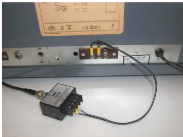
Photo shows typical classic radio (antique radio) installation with supplied twin-lead cable.