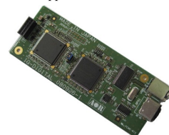
Plug-in to the AR5001D Approx. size 100 x 50mm

When an optional I/Q interface board is installed, up to 1MHz of digital I/Q output can be recorded to the hard drive of computers operating under Windows environment for later playback and analysis without any loss of quality. This feature allows for unattended logging, signal classification and signal analysis. PC Control software for Windows XP, VISAT and 7 is supplied with the board.